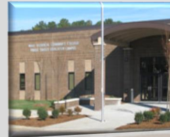
Public Safety Ed. Campus