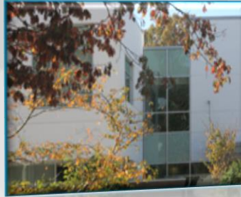
Southern Wake Campus (formerly known as Main)