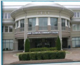
Western Wake Campus