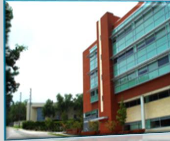
Perry Health Sciences Campus