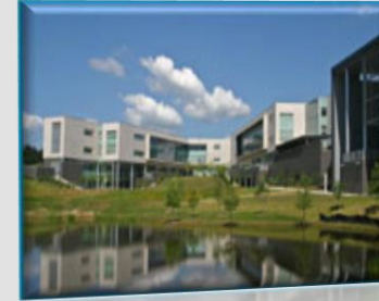
Northern Wake Campus